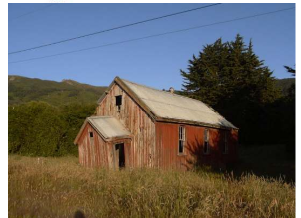
Woodside Mission Hall

This trail is a gentle walk, bike or drive round some of the early buildings remaining in the Woodside area, which was the original settlement of Maungatua (Mountain of the Spirit).