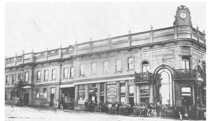
The Provincial Hotel in the 1860s