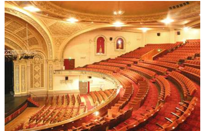
Regent Theatre Interior

A guided tour of locations connected with the history of cinema and theatrical entertainment in Dunedin.